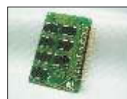
EXPANSION MEMORY BOARD TO 10,000 PLU's

With the expansion memory board you can up the PLU from 300 to 10,000 PLU's. (optional accessory, not included)